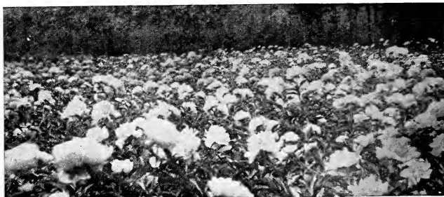
2,000 Festiva Maxima

No hardy perennial is of more permanent value than the Peony. The first cost is the only cost, and they continue to increase in size and value for many years. The foliage is rich and of beautiful deep green color, which renders the plant very ornamental even when out of flower, and few other flowers are so well adapted for interior decoration and none make more massive color effect when planted in a border or in a bed on the lawn. Their popularity has increased during the past few years since the new improved varieties have been disseminated. Peonies range in color from cream and pure white through the various shades of pink and red to the deepest purple and maroon, in all possible combinations of tint and form.